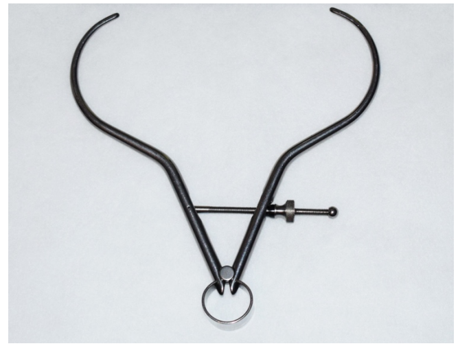
Outside Calipers, Digital Calipers Used for measuring Bizygomatic Breadth & Menton-Sellion Length

All test method acceptance criteria were met. Testing was performed in compliance with US FDA good manufacturing practice (GMP) regulations 21 CFR Parts 210,211 and 820